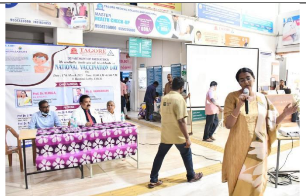
Geotag and/or caption with date