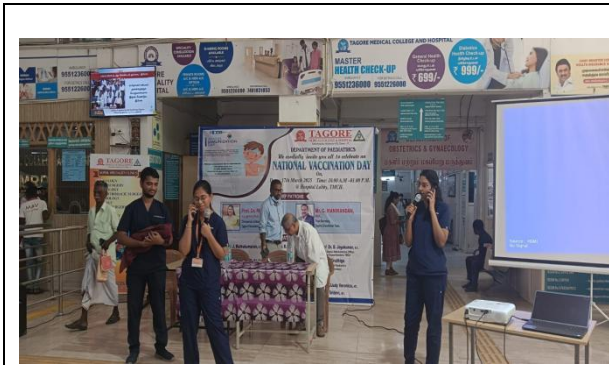
Geotag and/or caption with date

(Affiliated to the Tamil Nadu Dr.MGR Medical University & Recognized by the Ministry of Health & Family welfare. Govt. of India New Delhi)