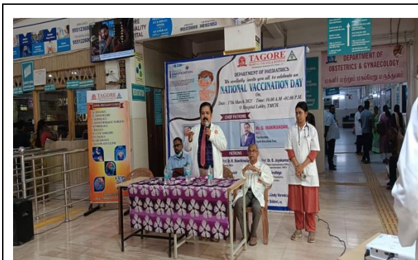
Geotag and/or caption with date