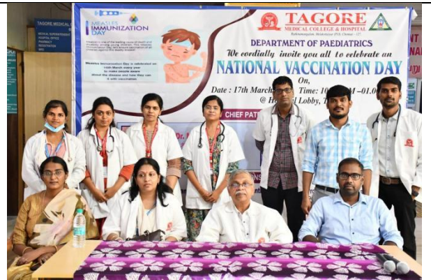
Geotag and/or caption with date